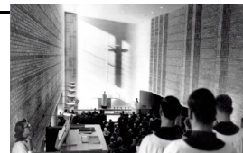
THE SUBURBAN CHURCH MODERNISM AND COMMUNITY IN POSTWAR AMERICA