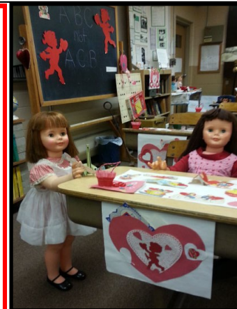
Visit the Museum !

Village Hall Park Forest, 350 Victory Drive. Free and open to the general public.