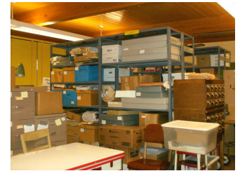
A place for everything — almost!