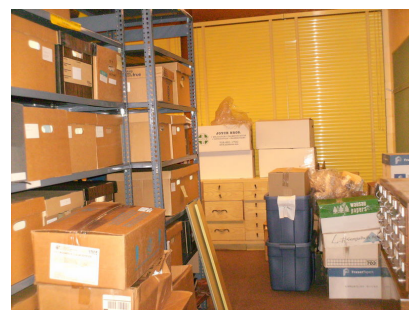
And more boxes