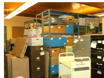
Boxes and more boxes

Thanks to everyone who helped with the move! We couldn't have done it without you.