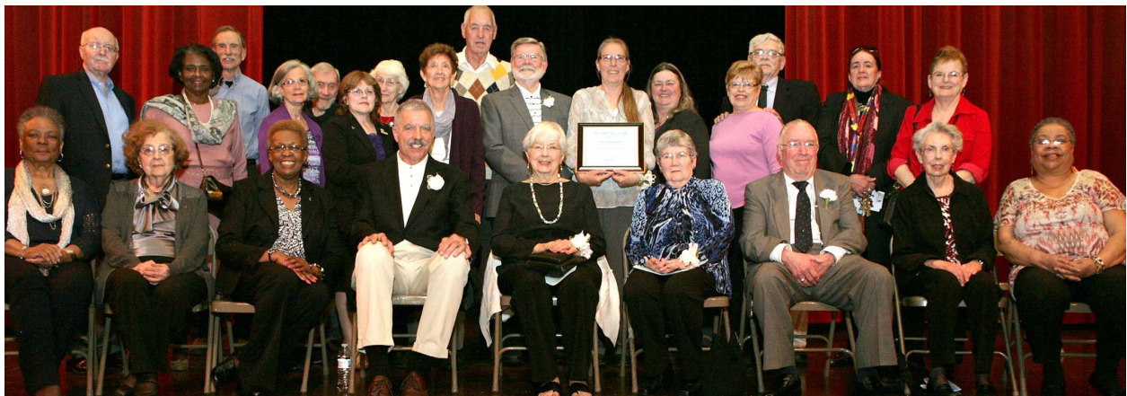
Members of the Park Forest Hall of Fame gather for a group photograph after the 2015 induction ceremony.