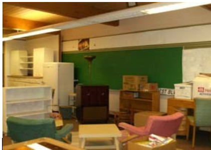
Two views of the House Museum as laid out in the St. Mary Church.

The rooms are laid out in a reasonable facsimile of a house, after painstaking planning of the space. Big thanks to Al Jones of Superior Cabinet and Window for building a rolling platform, with "kitchen" walls to hold the original kitchen cabinets from 141 Forest Boulevard. Also, a big thanks to the maintenance staff of Central Park Apartments who